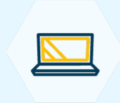
Enterprise & Pro Audio Visual