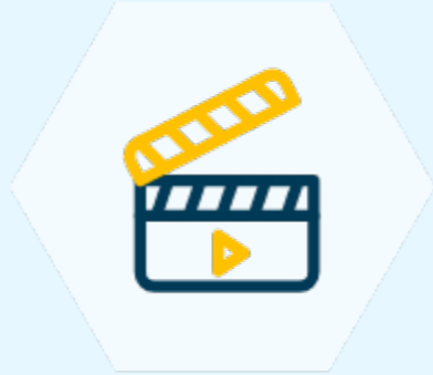
Media & Entertainment